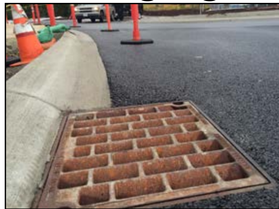
Crews completed drainage installation work in Medina. The new drainage system throughout the new corridor improves stormwater treatment.