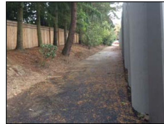
Crews opened the bicycle and pedestrian path between 84th Avenue Northeast and Evergreen Point Road on the south side of the SR 520.