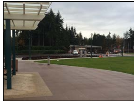
Crews continued to install landscaping on the 84th Avenue Northeast lid.