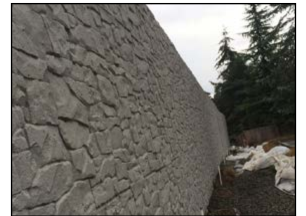
Crews continued wall painting activities throughout the corridor. This work requires dry weather and may continue through the winter.

Visit the SR 520 Orange Page for the most up-to-date project information: www.wsdot.wa.gov/projects/sr520bridge/520orangepage