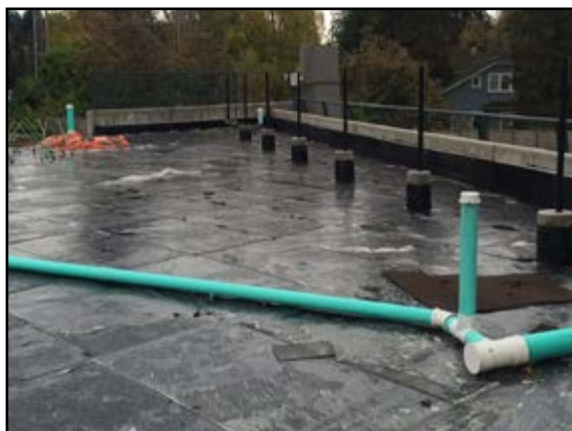
Crews completed waterproofing activities on the 92nd Avenue Northeast lid.