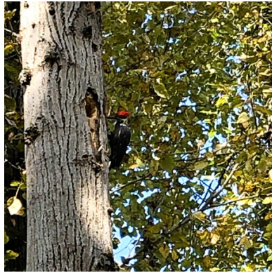
A pileated woodpecker drums on trees and searches for insects.

Consider sending photos of wildlife you've seen in WNP so we might post them on our website and newsletters. Email to wetherillnaturepreserve@gmail.com .