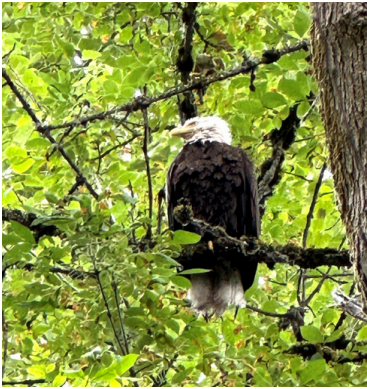
A bald eagle keeps a close lookout for food and predators.

Habitat havens within the Preserve are essential for wildlife because they provide safe spaces for species to thrive without the threats of urbanization, pollution, and human interference. These protected areas offer shelter, helping wildlife to maintain healthy populations and ecosystems. Since Preserves also serve as crucial breeding grounds, habitat havens help with the continuation of species and biodiversity, which is fundamental to the overall health of our planet.