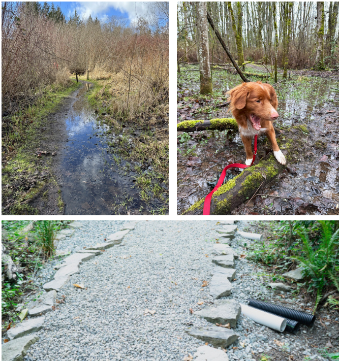
Top images: Seasonal rain, increasing lake levels, and storm water runoff create a muddy mess on popular WNP trails. Bottom image: Pilot project for drainage improvement and trail repair.

THANK YOU to those who have already made generous gifts to the WNP Special Projects fund!